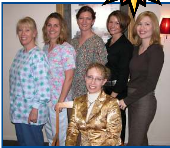
The Gang's All Here - Your Office Staff

Summer Bleaching Special! $199.00 Normally $250.00 – Trays Only Price good thru August 15, 2006