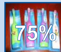
Sonicare Personal and Sonicare Plus