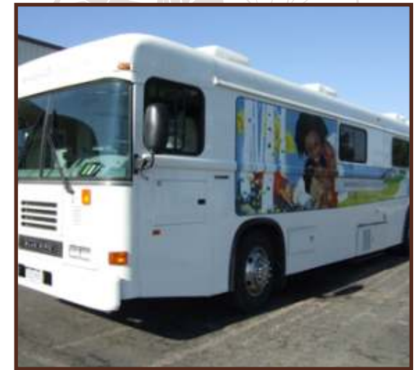
Bonfils Mobile Blood Unit